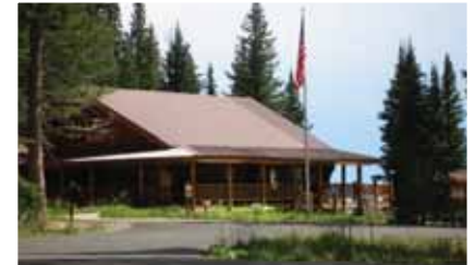
Grand Mesa Visitor Center, Grand Mesa National Forest, CO