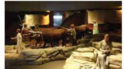
National Historic Trails Interpretive Center, Casper, WY