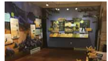
Centennial Visitor Center, Medicine Bow National Forest, Centennial, WY