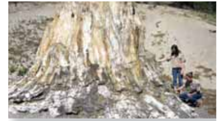
Florissant Fossil Beds National Monument, Florissant, CO

Centennial - This Forest Service Nature Store in Medicine Bow National Forest used their aid to fund 940 hours of volunteer stipends as well as to distribute free Smokey Bear interpretive swag to children throughout the summer.