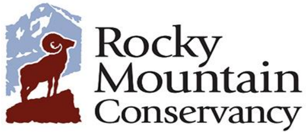
2022 Philanthropy Goals