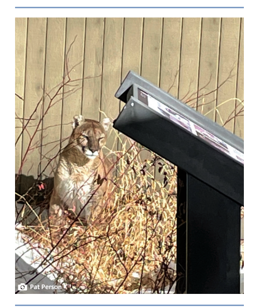
Conservancy Nature Store Clerk Pat Person captured this picture of a living mountain lion exhibit outside the Kawuneeche Visitor Center in mid-winter.