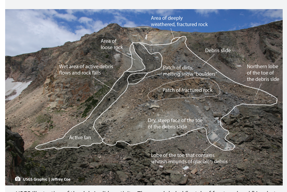
USGS illustration of the debris slide activity. The area labeled "patch of fractured rock" is what remains of the rock formation, "Two Towers."

To make a gift to support Rocky Mountain National Park, visit RMConservancy.org, or call 970-586-0108.