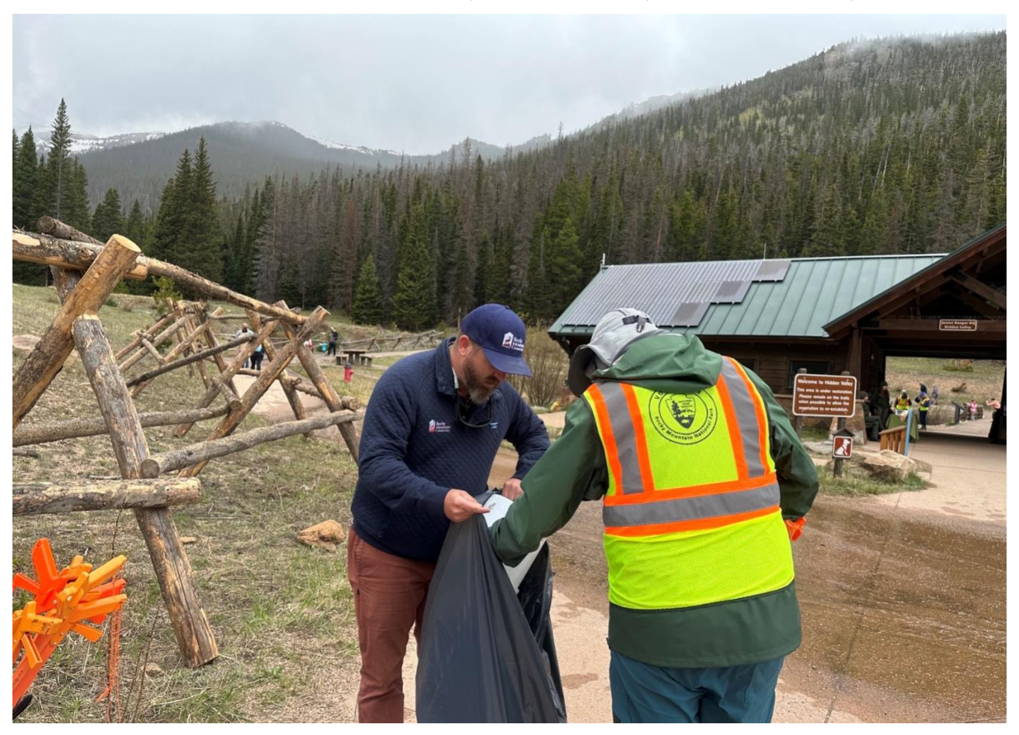
June 3<sup>rd</sup> National Trails Day: Litter Cleanup at Hidden Valley

The American Hiking Society declares the first Saturday in June as National Trails Day. On June 3<sup>rd</sup>, 2023, a fleet of 27 volunteers from across Colorado's Front Range arrived in Rocky Mountain National Park's Hidden Valley. The only place in ROMO to allow winter sledding, Hidden Valley sees heavy traffic throughout the year from sledders, skiers, hikers, and families. When the snow melts in spring, massive amounts of microplastic trash from the winter season are revealed.